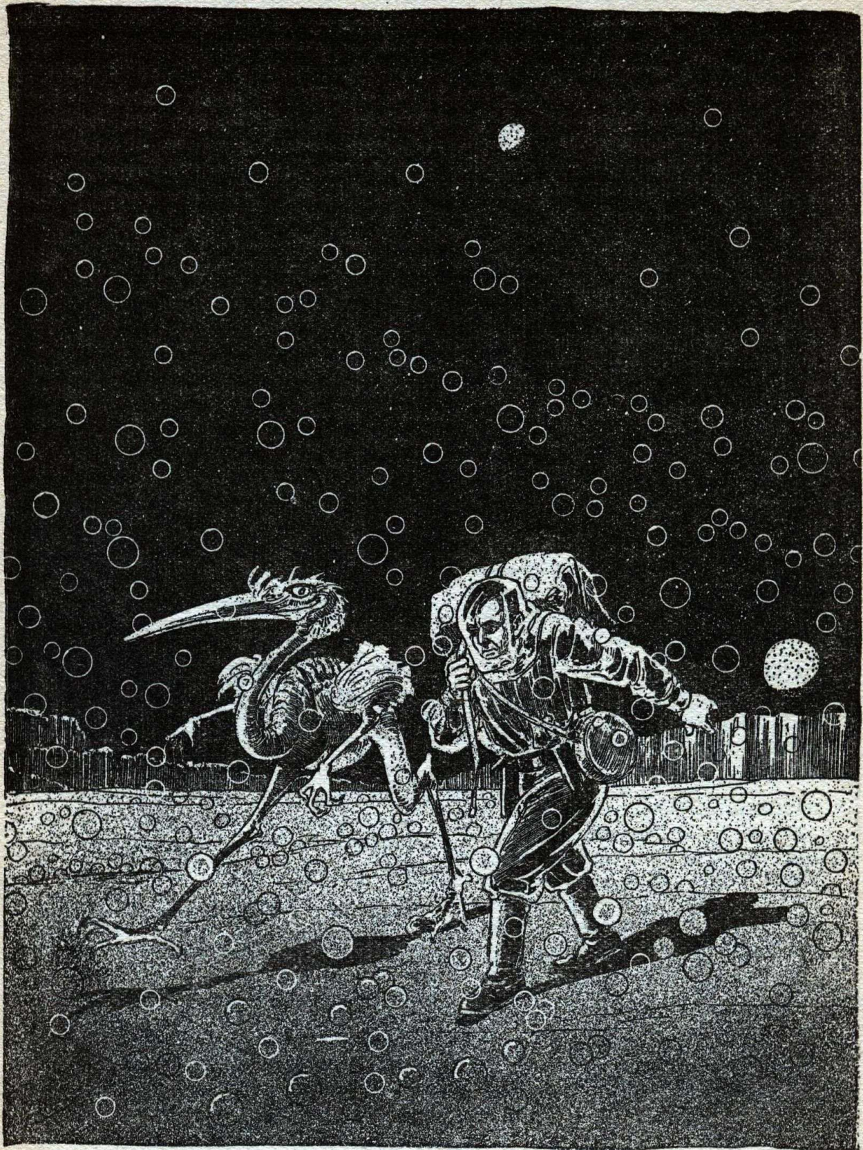
(Illustration by Paul)

But suddenly things came drifting along—small, transparent spheres, for all the world like glass tennis balls!